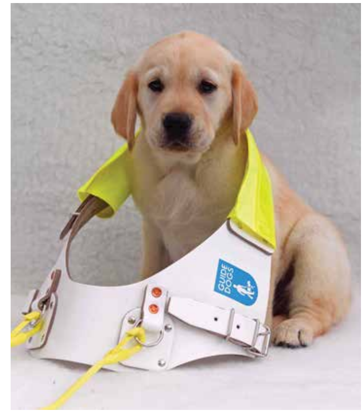
A guide dog puppy.