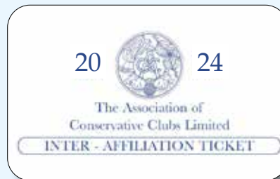
IA Ticket- £2.00