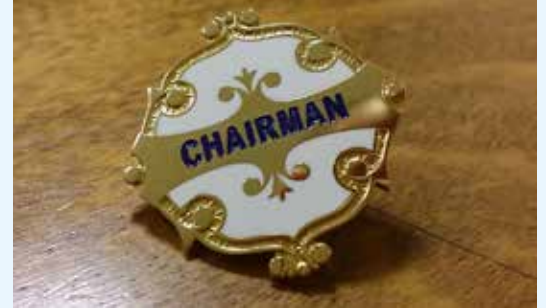
Range of Committee Badges - £5.00