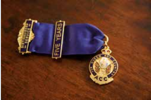
Distinguished Service Award - £30.00