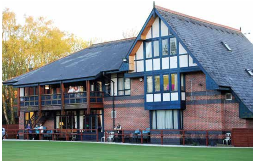
The Wilmslow Conservative Club.