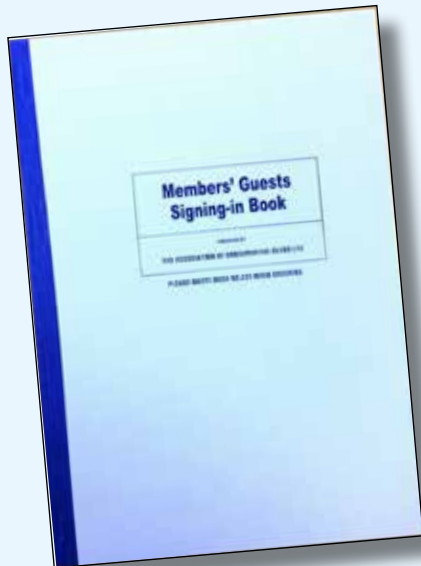
Range of Stationary Books