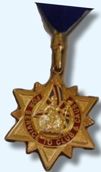
Badge of Honour - £75.00