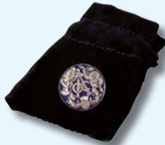
Lapel Pin - £3.50