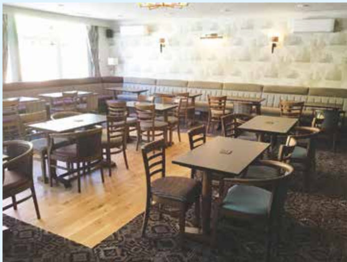
The new lounge.

The Club welcomes any IA Ticket Holder to visit the Club if they are in the area and hopes to continue the increase of new Members that the Club has enjoyed since the refurbishment was completed.