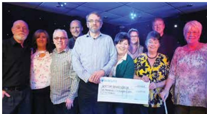
The Club's Cheque Presentation Evening.

The Club's Committee would like to thank all Members who took part and look forward to beating the total raised at the next event.