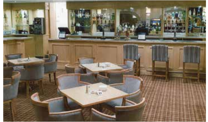
The Club's renovated bar area.