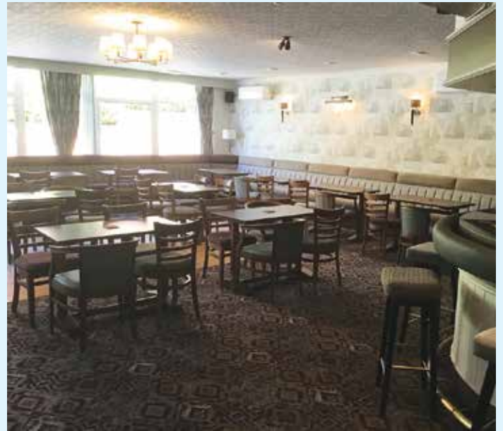
The new lounge.