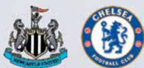
Newcastle v Chelsea Sunday 26 August, 4pm Premier League