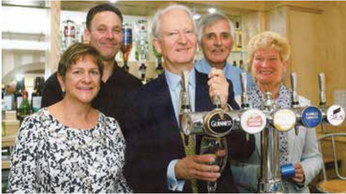
Sir Henry Bellingham MP along with Members of the Club's Committee at the official relaunch of the Club.

The ACC Congratulates the Club on its refurbishment project and its fantastic results.