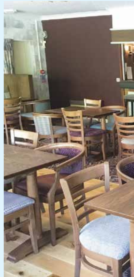
The new lounge and bar.

Work on the extensive refurbishment of the bar and large lounge was completed in just two weeks by the very professional refurbishment team with new seating and tables and colour-themed decoration involving wallpaper, seating fabrics, wall paint and carpet giving the area a warm, modern and, most importantly, welcoming finish. A new specially designed dance floor has been introduced to assist with