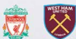
Liverpool v West Ham Sunday 12 August, 1.30pm Premier League