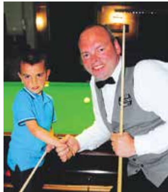
Images From The Snooker Event.

he wanted his money to be used after his death. He hoped that his