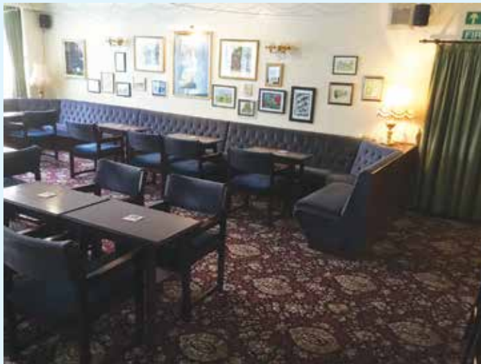
The old lounge.