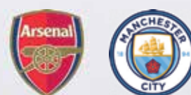
Arsenal v Man City Sunday 12 August, 4pm Premier League