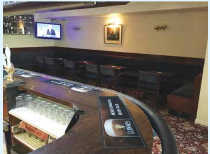
The old bar.