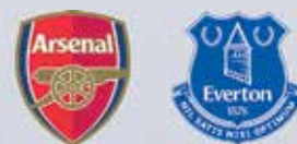
Arsenal v Everton Sunday 23 September, 4pm Premier League