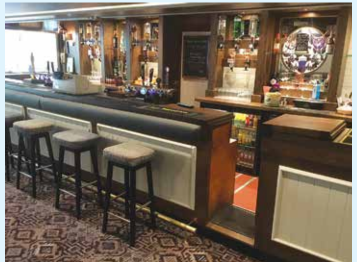
The new bar.