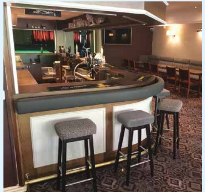
The new bar.

Club's Members. In keeping with modern trends, a new Gin Corner has been introduced with a selection of flavoured and artisan liquors. The Club notes that Rhubarb and Ginger have been very popular flavoured gin additions.