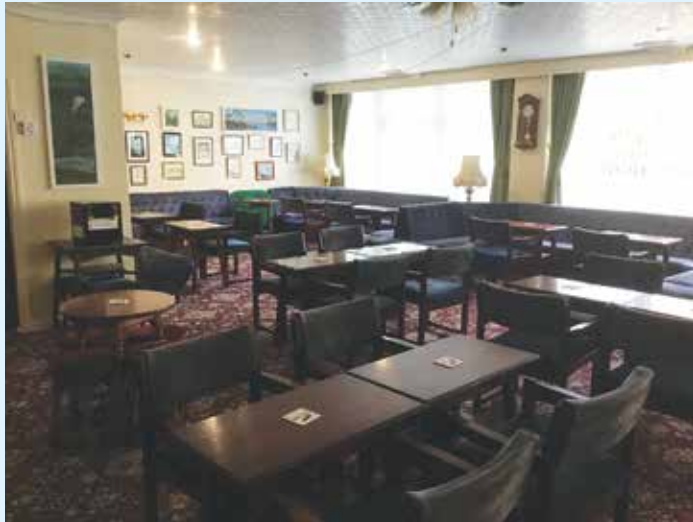
The old lounge.

Full, whisper-quiet air-conditioning has been added to the lounge and snooker room and a larger gas boiler has been installed for the comfort of the Club's Members and guests. A new high definition television gives potential for great viewing of major events, including the World Cup which has recently being enjoyed by the