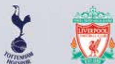
Tottenham v Liverpool Saturday 15 September, 12.30pm Premier League