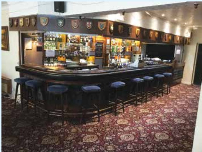
The old bar.