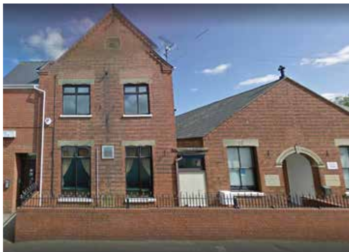
The Sutton Bridge Constitutional Club.