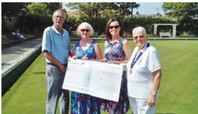
The Cheque Presentation Ceremony.