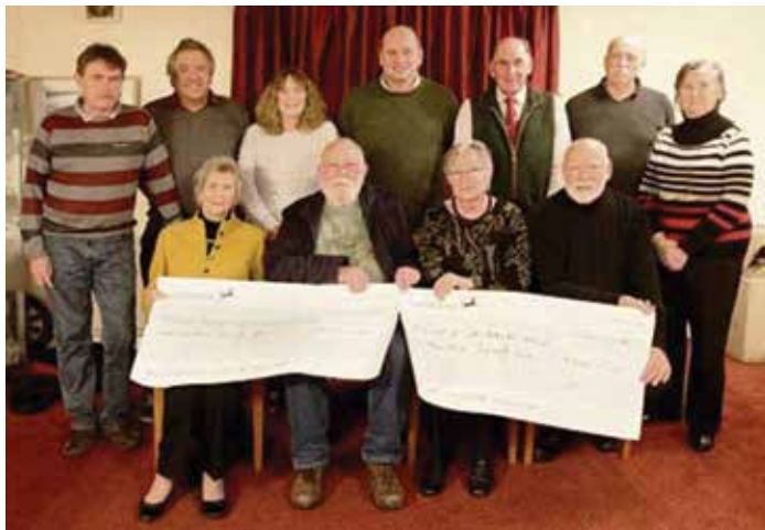
The Cheque Presentation Ceremony.