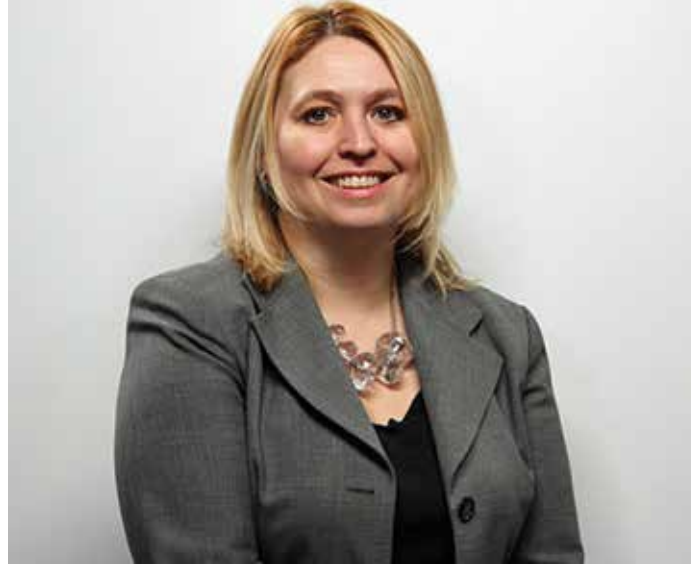
Karen Bradley MP.

Clubs wishing to attend should ensure a prompt return of the invitation since space is limited.