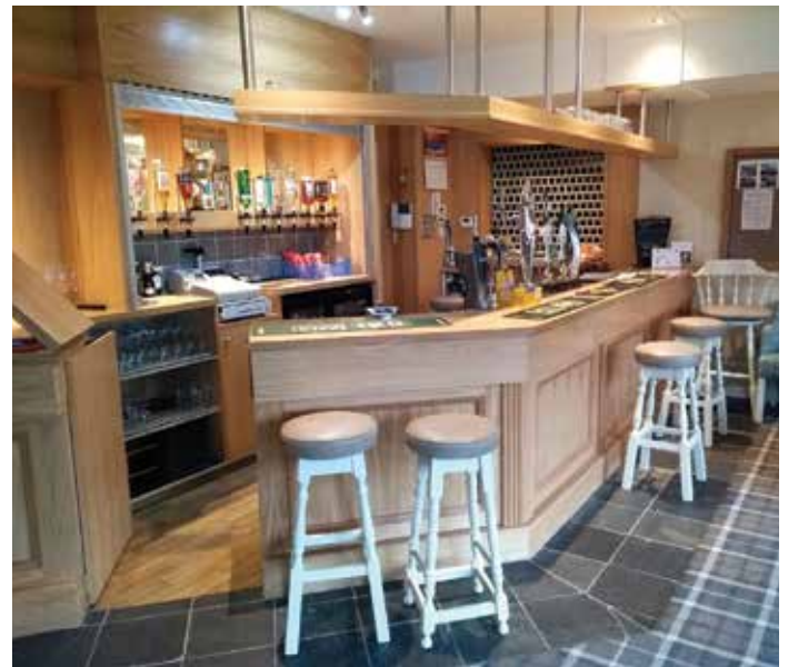
After The Refurbishment.