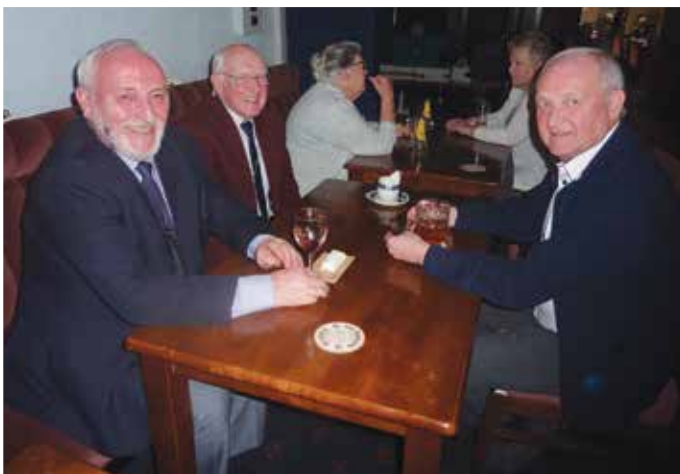
Members visiting Preston Conservative Club.