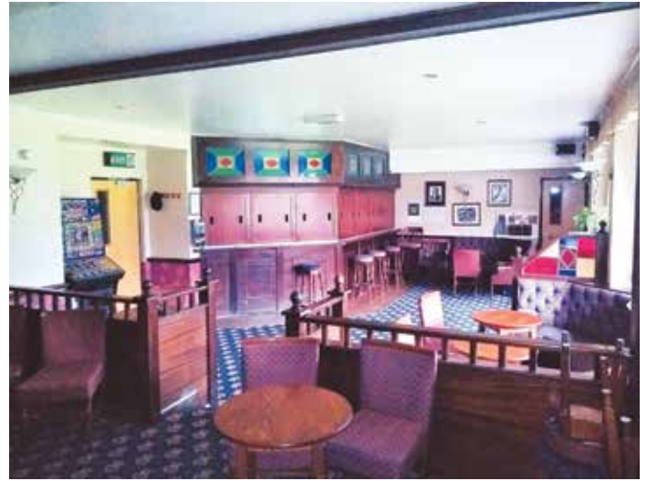
Before The Refurbishment.