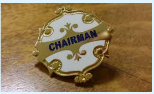
Range of Committee Badges - £5.00