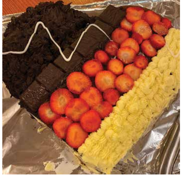
The Heart Cake.

The ACC congratulates all Clubs spending time on fundraising for these worthy and lifesaving machines