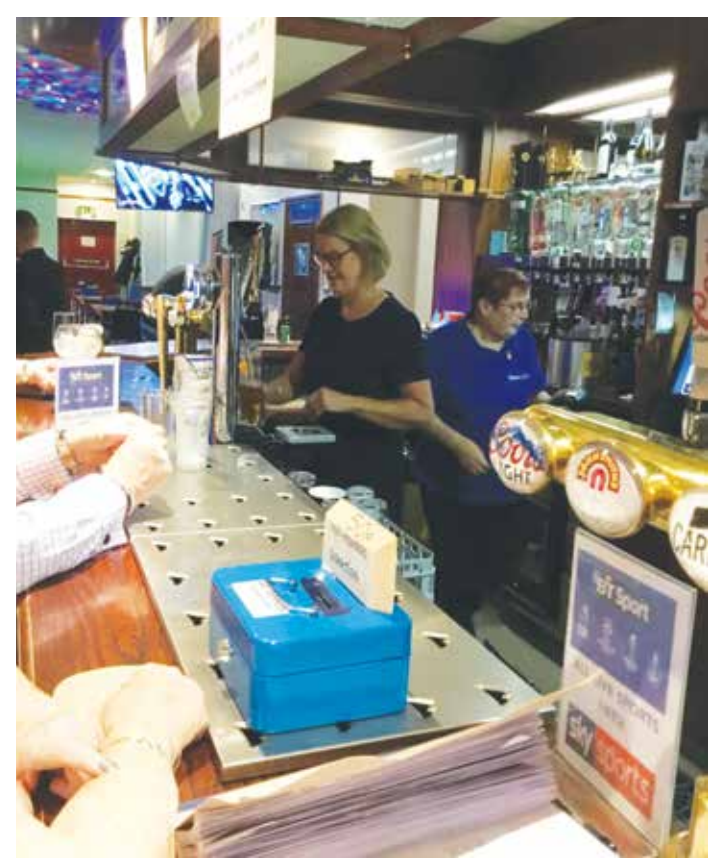
Donations being taken at the bar.