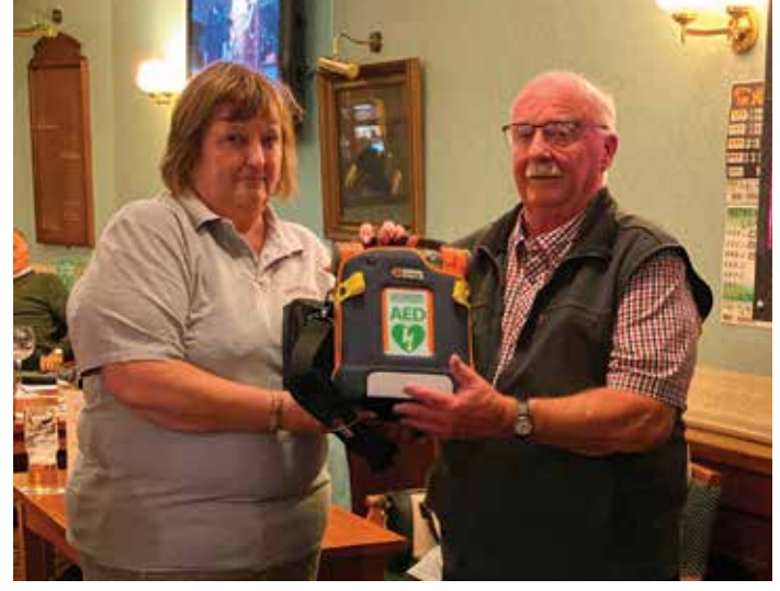
The presentation of the defibrillator machine.