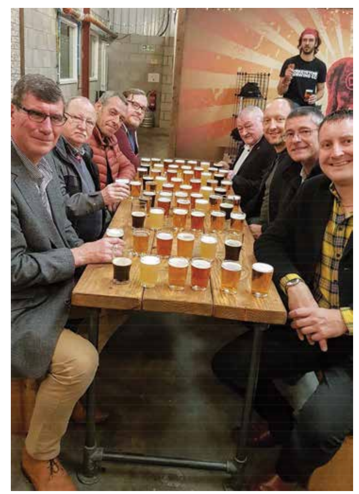
Photographs from the day.