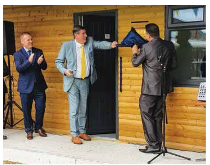
Unveiling the Plaque.