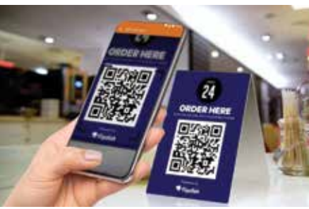
bar and women half as likely to do the same compared to the men (24% versus 11 % respectively). • www.flipdish.com/gb

The research, commissioned by Flipdish, polled 516 UK respondents. Almost two-thirds of respondents (63%) said they are now more likely to visit a venue with a digital app and over half (55%) would actually miss ordering drinks via an app if it stopped. The preference for digital ordering intensifies among younger demographics and women, with only 14% of 18 - 24 year-olds surveyed preferring queuing at the