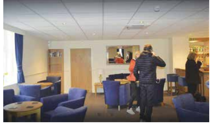
Members enjoying the new bar area.

The Club welcomes any IA Ticket Holders to visit the Club if they are in the area.