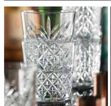
Utopia has introduced three new toughened stacking ranges, designed to bring functionality to the bar without sacrificing style. The Highness is a feature tumbler in three popular sizes. Also available in three sizes is the Timeless Vintage with a classic cut glass effect. The Hill range is described as clean cut and refined, for 'no fuss' drinkers.