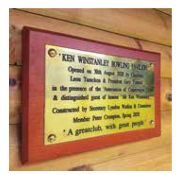
The Kenwinstaley Plaque.

The ACC is sure all of the Club's Members will enjoy the new bowling facilities.