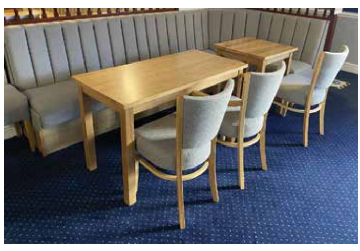
The Club's New Seating Area.

the benefit of their very loyal membership.