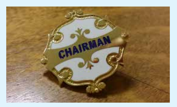
Range of Committee Badges - £5.00