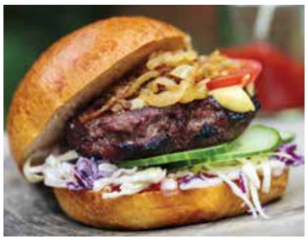
salt beef, the combined Campbell Brothers business offers the industry's broadest range of both prime cuts and prepared products." • campbellbrothers.co.uk

"From bespoke burgers for the barbecue, to beef dry-aged in our salt wall chamber, prime steaks and deli specialities including our renowned Henson's