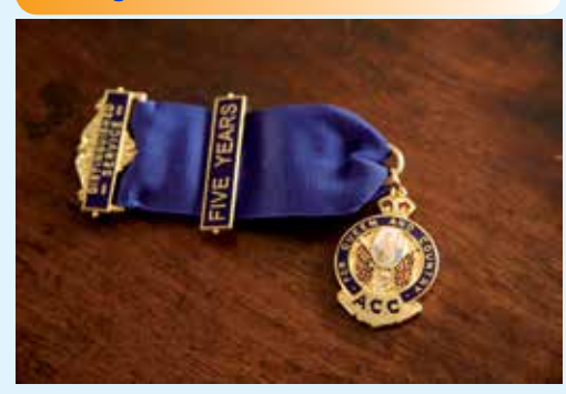
Distinguished Service Award - £30.00